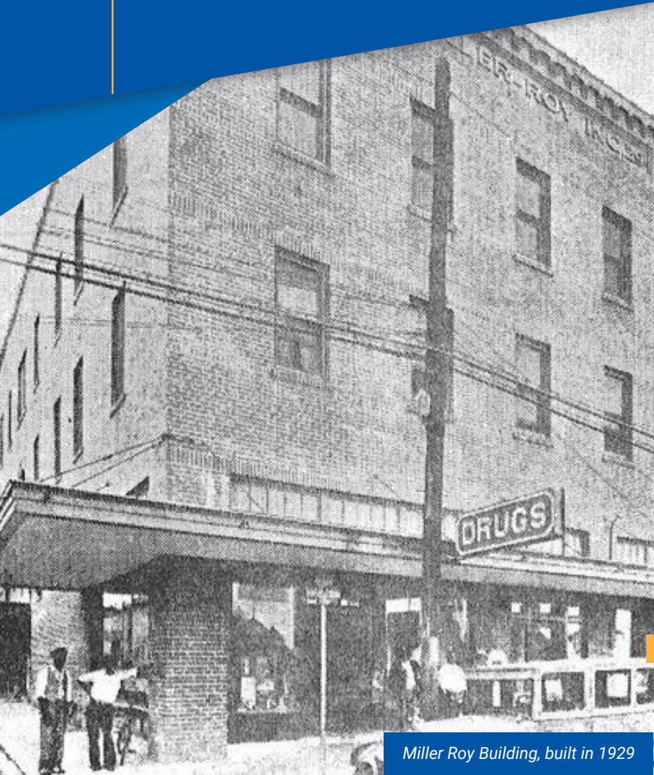
Miller Roy Building, built in 1929